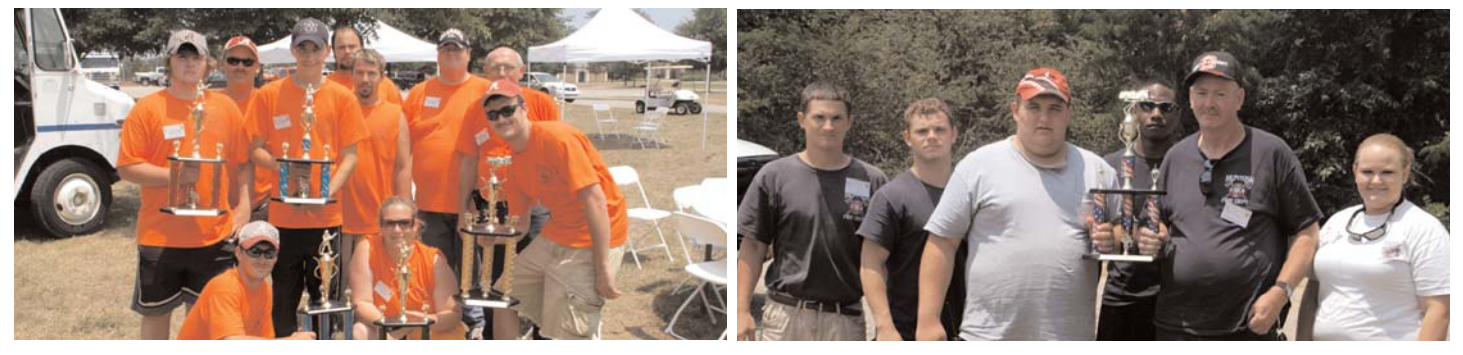
Hollis Crossroads 2nd Place