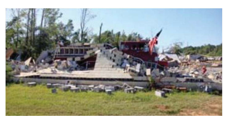
Eoline VFD Bibb County

In addition to Eoline and Hackleburg VFD, also destroyed were Webster's Chapel in Calhoun County, Ellisville VFD in Cherokee County, Cromwell-Halsell VFD in Choctaw County, Johnsons Crossing VFD in Cullman County, Kowaliga VFD Station 2 in Elmore County, and Shoal Creek VFD in St Clair County. Heavily damaged were Tishibee VFD in Greene County, Chalybeate Springs VFD in Lawrence County, Cordova VFD in Walker County, and East Limestone and Tanner VFDs in Limestone County.