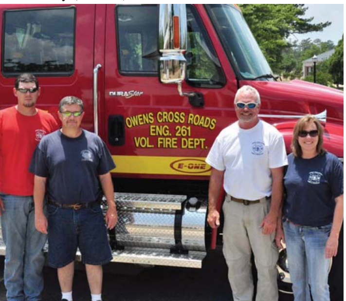
Owens Crossroads VFD, Madison County, was recognized as "Department of the Year". The department displayed the new Tradition ES pumper that they won from E-One's "Tell Us Your Story" contest in 2010.