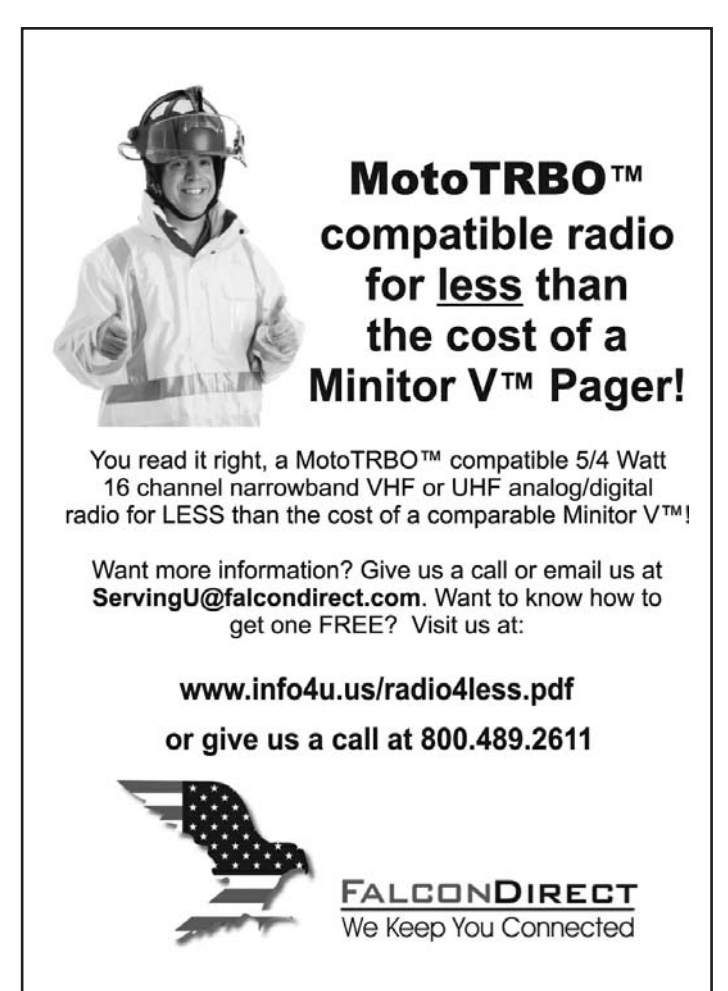
Page 20, Apr. – June 2011

Please join me in supporting this important legislation.